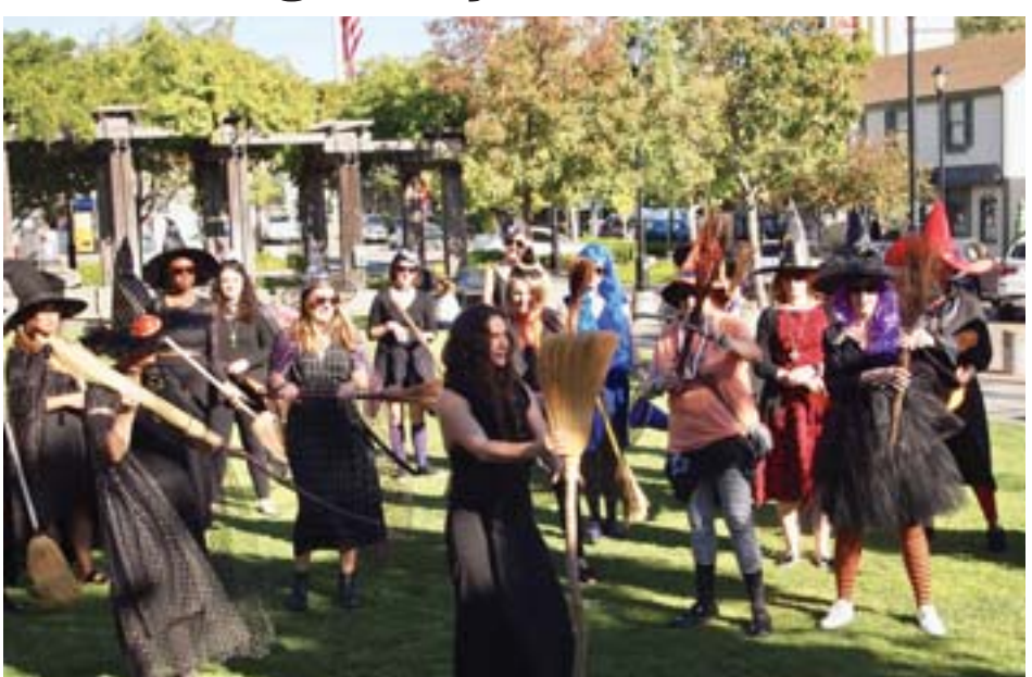
Local witches brush up their broom dance on the Plaza Oct. 5.

Halloween got off to an early start this month with a coven of witches expressing their spooky style as they rocked the broom dance on the Plaza Oct. 5 before heading out for a walk